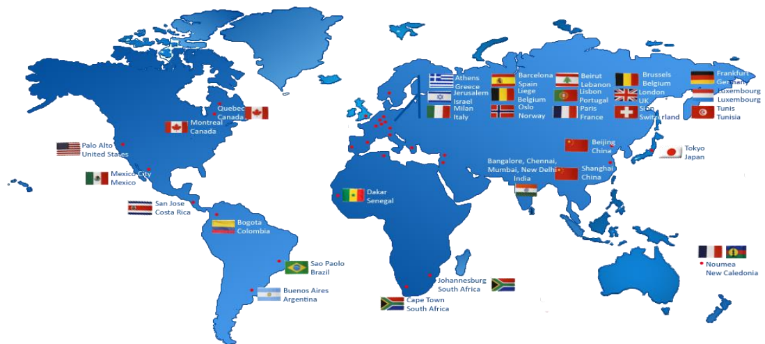
Global network of attorneys specialized in digital and emerging technology law